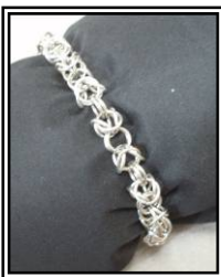
Byzantine Bracelet with Barb 2/24 Wed. 10-1pm & 6:30-9:30pm Fee: $35

Not One... Not Two... But Three Spirals for the price of one class. Call within the next 10 minutes to be eligible for bonus Tips and Techniques. This exclusive offer is valid for all beaders to expand their spiral skills. All levels.