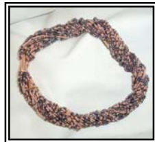
But Wait, There's More with Barb 2/18 Thu. 10-2pm & 6-10pm Fee: $45

Here's a great non-aerobic spin class that will still get your heart rate up. Exercise your creativity and tone your cone skills. Prerequisite: Earring Workshop.